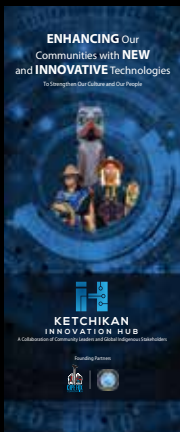
CFC received a grant to provide residential broadband connectivity, related devices, and computer software to qualified households in Ketchikan and the surrounding area.

The Cape Fox Corporation (CFC) established the Cape Fox Shareholder Tináa Trust (The Trust) in July 2019. The Trust offers significant tax-related benefits to Shareholders and the Corporation. Along with corporate economic benefits for our Shareholders, additional benefits from The Trust in 2022 included Bereavement Assistance and Shareholder Distributions.