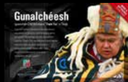
Online and in-store fundraisers were held to assist Cape Fox Cultural Foundation with bringing educational experiences to the public, while helping preserve and support Tlingit heritage and culture.