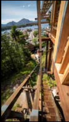
Eagles Nest Pizzeria continued to build-out the restaurant space for an anticipated opening in 2023.

In 2022, Cape Fox Corporation (CFC) continued to invest in our tourism and commercial businesses. We were delighted to have our first full tourism season in two years, which allowed us to expand our commercial investments by purchasing more vans for our Cape Fox Tours, beginning construction on a new commercial business, and beginning renovations to the Cape Fox Lodge tram system. 2022 also saw an increase in the digital development of our commercial businesses and offerings. These digital services will allow CFC to educate further and promote CFC and the Tlingit culture while also allowing us to continue to support and provide for our community.