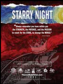
Each year Cape Fox Corporation invests in our local youth programs with donations and sponsorships.

Tlingit natives believe strongly in family and community. We believe that by giving back to others within the community, we are making everyone stronger. Cape Fox Corporation (CFC) has carried those core beliefs into the business. As CFC continues to grow, expand, and succeed, we have discovered increased opportunities to give back through the Cape Fox Cares Program. Cape Fox Cares was established in 2019 to have an organized and effective community support program. CFC's mindful approach to social giving cares about our local communities across the nation, wherever CFC exists. We strive to preserve our Tlingit and CFC culture, educate our youth, support our military, and strengthen our communities because CAPE FOX CARES. With the growth and financial stability of the organization in 2022, we saw increased opportunities for CFC to support our communities through philanthropy and events. In 2022, CFC donated over $55,500 to support our friends, neighbors, and community.