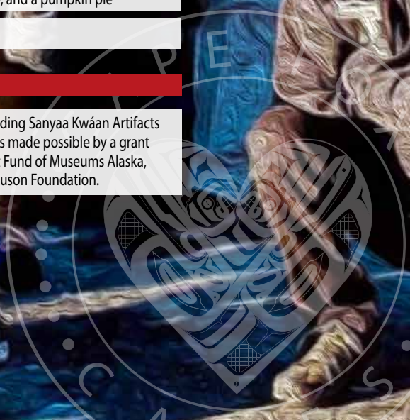
Volunteers from the Christmas food give-a-way.